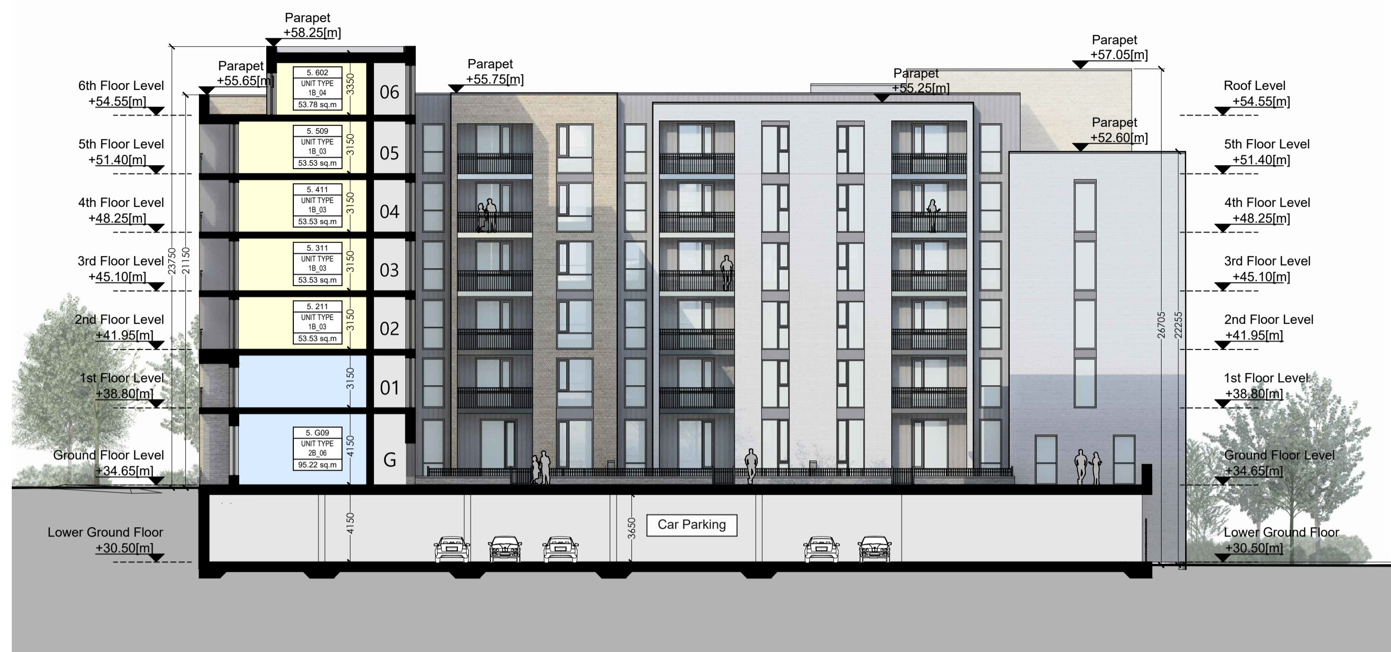
Elevation / Section E-E - Block 5 Scale 1:200 @A1